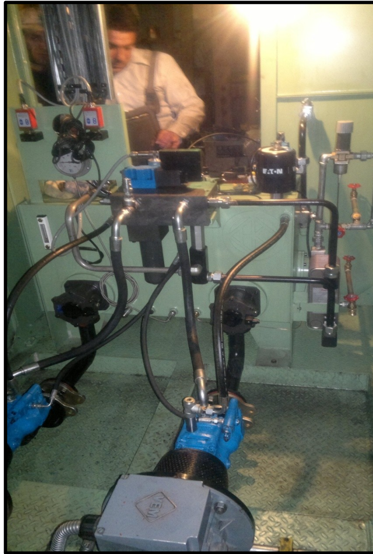
Fig 4 – Upper Burden Feeder Power Unit