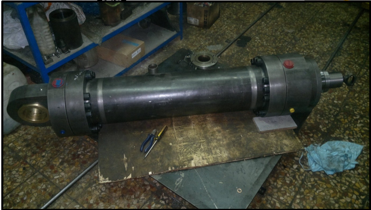
Fig 2-Middle Burden Feeder Cylinders