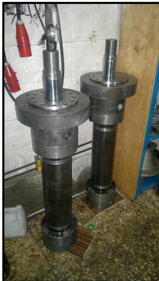
Fig 1-Slide Gates Cylinders

Cylinders for upper and lower slide gates middle and lower Burden Feeder have been assembled and tested by our staff under supervision of customer inspector in our test rig. Moreover, all test result have recorded and approved by customer inspector. With respect to customer inquiry ultrasonic test was performed by an authorized company on welded part of Cylinders Fig 3).