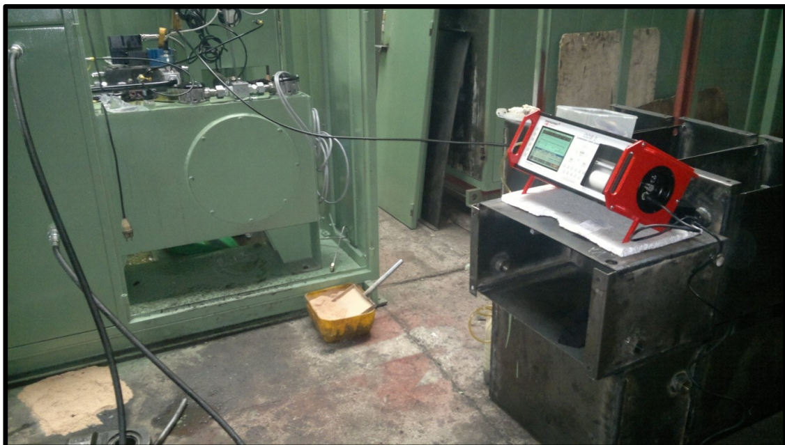
Fig 5 – Cleanliness level test for Upper Burden Feeder