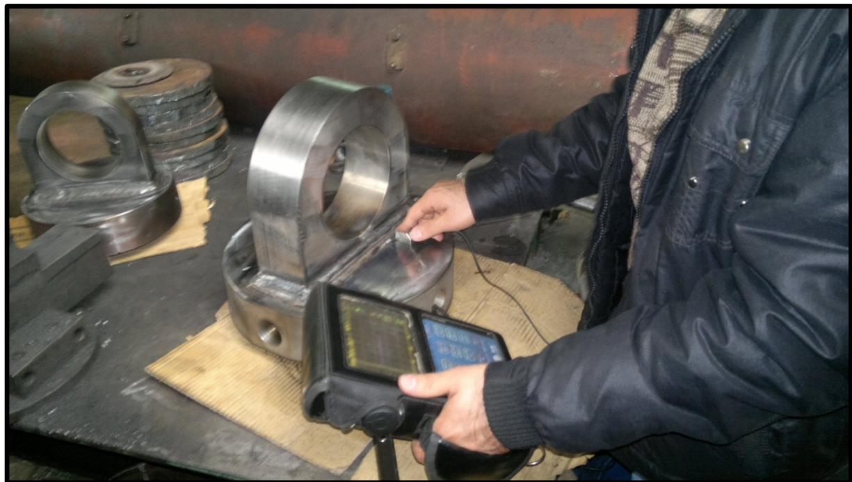
Fig 3 – Ultrasonic Test

Hydraulic unit for Upper Burden Feeder was finished and was tested completely by customer inspector. It's worth mentioning that all tested data was recorded and available for citation. Functionality of proportional valve, flow meter, and load sensing system and so on have been checked and verified. Moreover, hydraulic unit has been flushed and its cleanliness level was reached by using appropriate filter elements (fig 5).