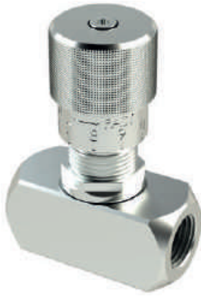
POMELLO IN ALLUMINIO PRESSOFUSO DIE CAST ALUMINIUM HANDKNOB